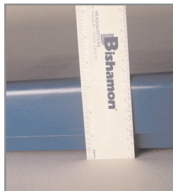
2.9" Lowered Height On Models Up To 1,100lbs