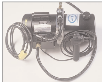
Remote Power Unit