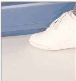
Full Perimeter Electric Toeuard